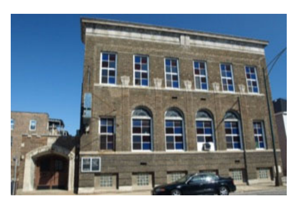
114 E. 59th