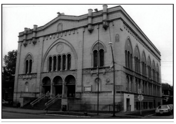
outh Side Hebrew Congregation 3rd and Chapel 927 Aorris L. Komar Architect