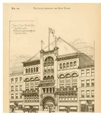
South Side Turner Hall

Kehilath Anshe Dorum (also known as South Side Hebrew Congregation or SSHC) was a Conservative synagogue, founded in 1889 with 12 members. Between 1893 and 1899, SSHC met at rented halls such as the South Side Turner Hall, 3143 State Street